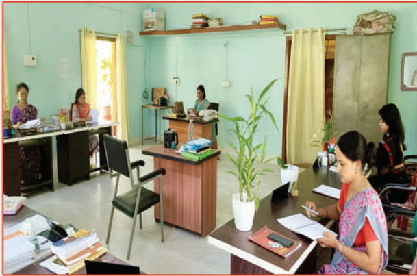
Teacher's Common Room